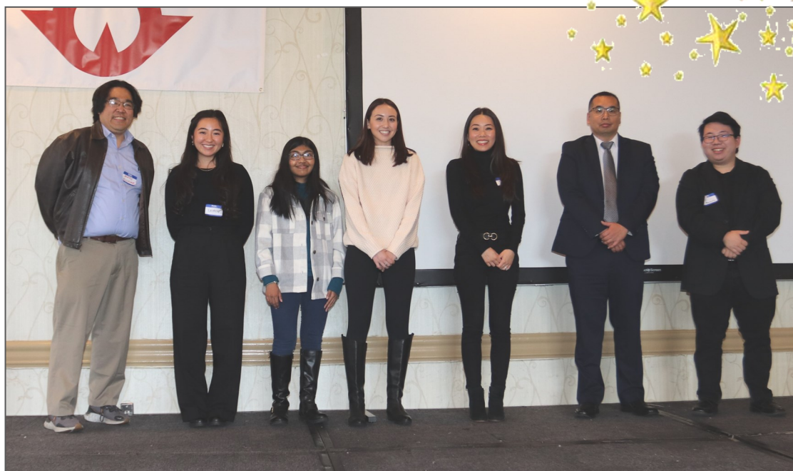
Current and Former Scholarship Recipients