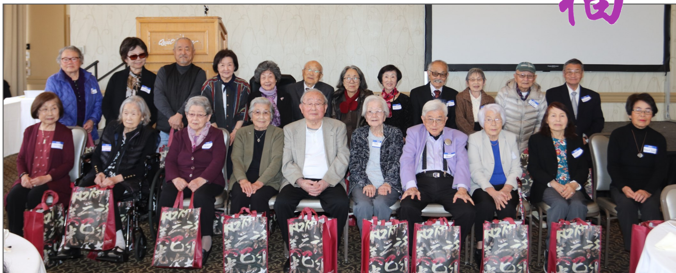
2023 80 Years+ Senior Members