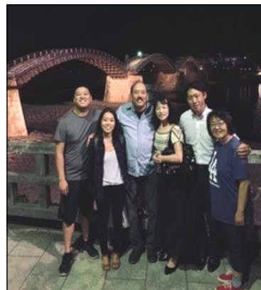
Kintai-kyo Bridge, Iwakuni