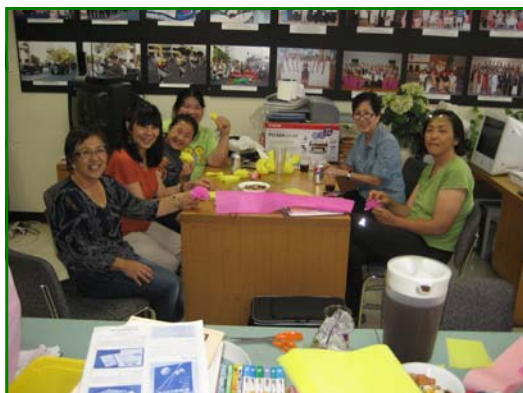
2012 NYK Members making the Kazari at the Koban in Little Tokyo.

Aug 8 5:00pm Opening Ceremony & Awards Presentation Aug 9 11am–7pm Viewing, food & children's game booths 12 noon–3pm Public voting for People's Choice Award Aug 10 11am–5pm Viewing, food & children's games booths Aug 11 All Day Viewing only