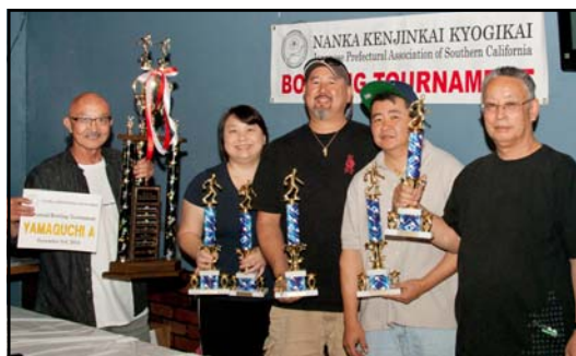
Last year our club placed 1st! Let's do it again and keep the trophy with NYK!