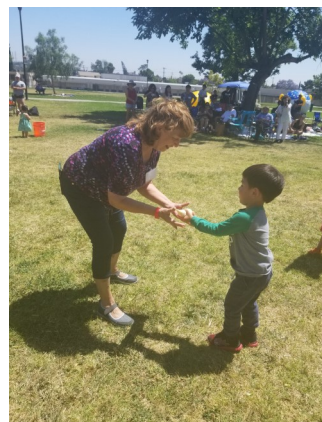
Hot Daikon Game The last two standing! Who would be caught holding the "hot" daikon?

Races and games followed and this year, they were held in the main picnic area. Races were grouped for boys and girls 3 & under; 4-6; 7-10; 11-14; and 15-18, followed by games for all ages which included a 3-legged race, water balloon games and the always fun "hot daikon".