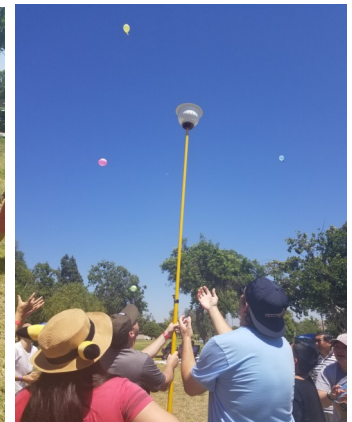
Which team will toss the most water balloons in the basket?