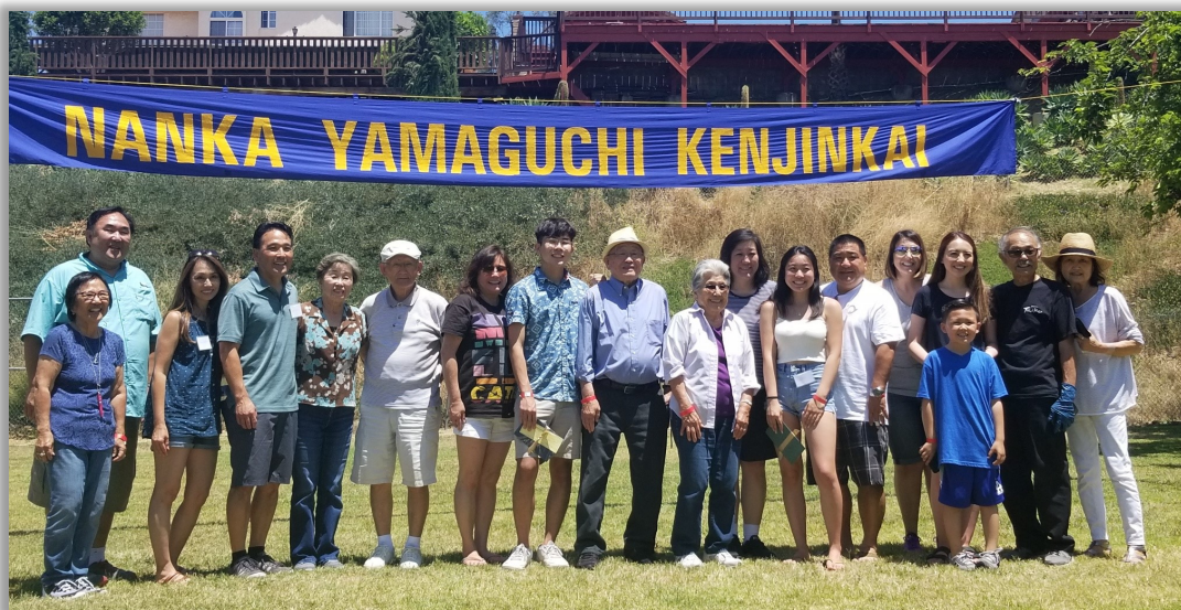
2019 NYK Scholarship Recipients Pose with their Families.