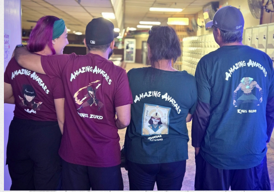
"The Amazing Avatars" rockin' their cool custom team shirts. A+ for styling!