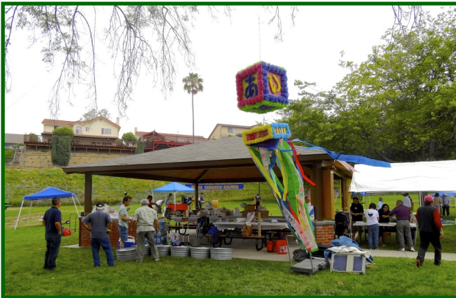
Board members and volunteers setting up early.

Approximately 125 Nanka Yamaguchi Kenjinkai members, families and friends gathered to enjoy a day of fun at the George Elder Park in Monterey Park. This was a new venue for our picnic due to renovations taking place at the private Leo Politi Picnic Grounds in Elysian Park. Despite Elder Park being open to the public, we were fortunate to have the entire park to ourselves. Amenities included a gazebo with sink and BBQ, a children's play area, a tennis court, many shade trees and a wide open area for games. Reviews from members of this new site have been very positive.