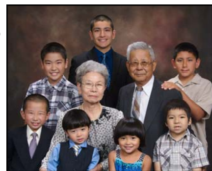
"He was a loving grandfather. He will always be in our hearts."