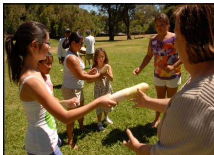
The “Atsui daikon” (hot daikon) game.