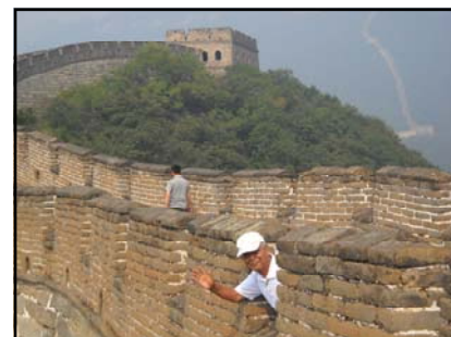
He loved to travel all over the world. At the Great Wall of China, September 2011.